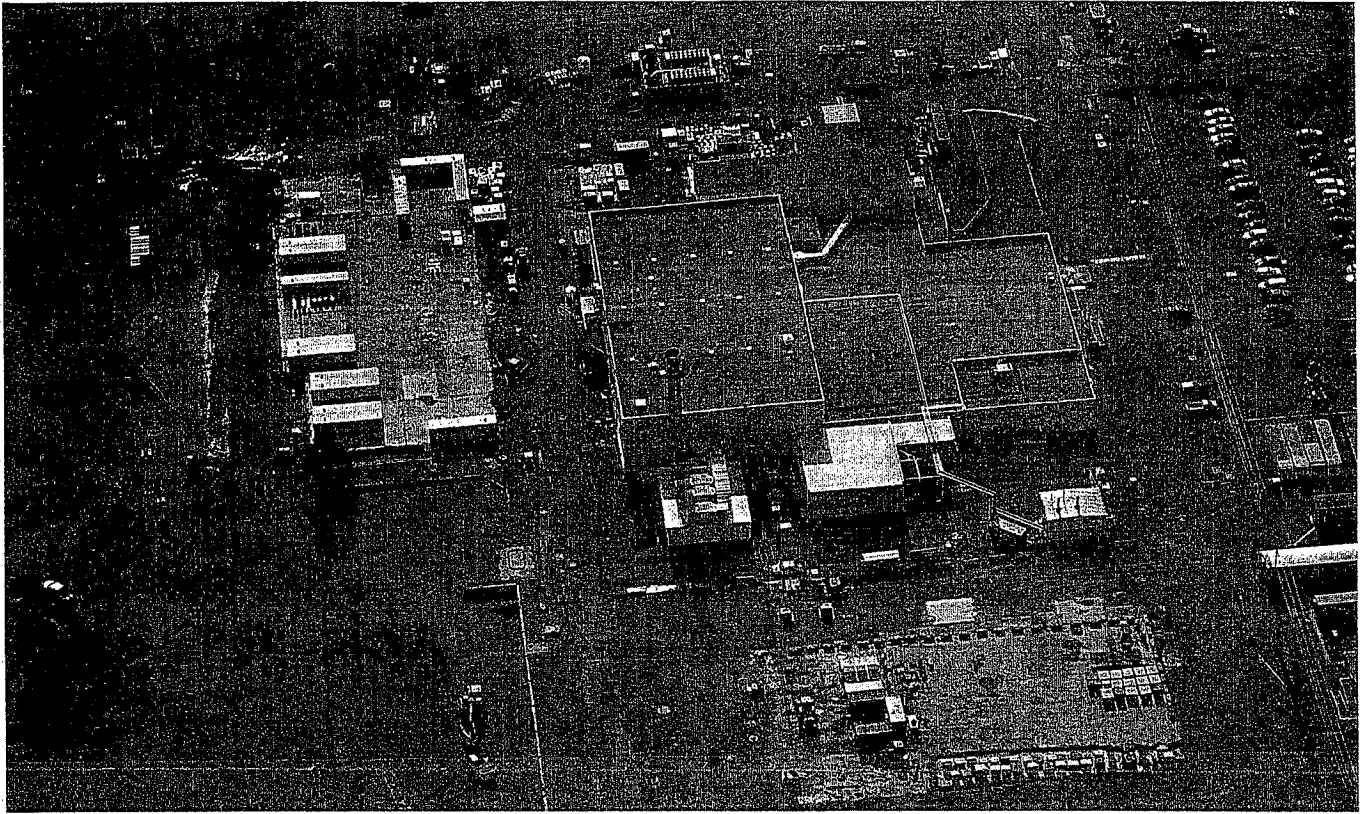
325 Hazardous Waste Treatment

crane. This unit would be used to load heavy waste containers in larger containers or boxes and temporarily store these larger containers.